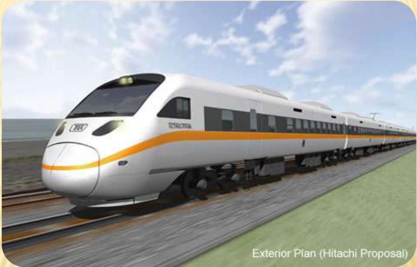
Exterior Plan (Hitachi Proposal)